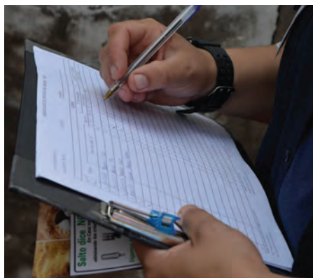
Health worker collecting records and filling out surveys with the inhabitants of Salto, Uruguay.

Understanding of public health surveillance differs considerably from country to country. Although surveillance is usually described as systematic or continuous, not all countries, institutions or scholars single out the routine nature of public health surveillance but rather emphasize the purpose and function of data collection (see Table 1). Likewise, although disease and injury always figure centrally, some definitions include determinants of important public health events (10) and environmental conditions that affect health (11). Vital registration of events like births and deaths, although often not specifically described as part of a “public health” surveillance system, is often considered to be surveillance.