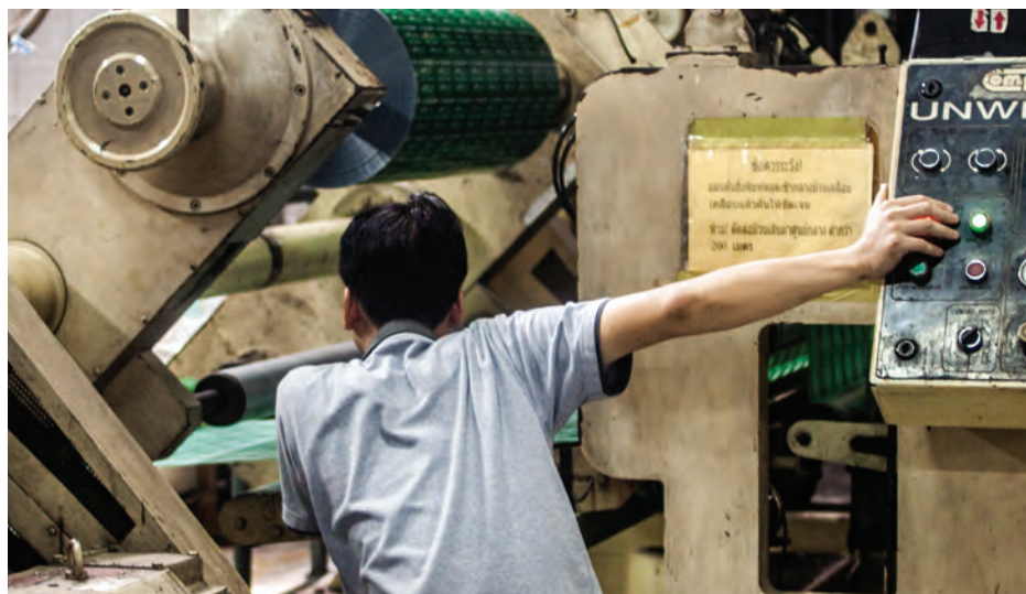
Kim Pai factory, Bangkok, June 2015.

The following guidelines, then, cover (i) the broad responsibility to undertake surveillance and subject it to ethical scrutiny; (ii) the obligation to ensure appropriate protection and rights; and (iii) considerations in making decisions about how to communicate and share surveillance data. These guidelines represent a starting point for the searching, sustained discussions that public health surveillance demands. Like other international guidelines on research ethics, the ethics of surveillance will require continuous review and revision in the light of experience.