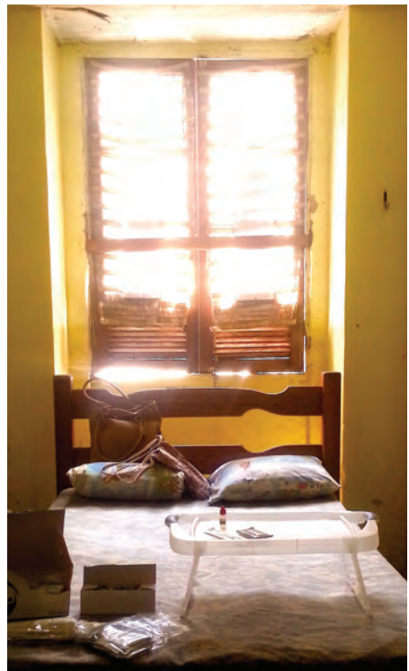
The HIV oral test on a brothel bed in Belém do Pará, Brazil.

be dismissed from work rather than receiving treatment or compensation. Wherever possible, susceptible groups should be identified before surveillance activities begin in order to minimize the risk for harm. In surveillance programmes, there should be constant monitoring for (further) harm to those in conditions of particular vulnerability. When harm does occur, a mitigation strategy should be put in place (see Guideline 8).