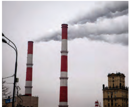
Industrial pollution. Moscow, Russia.

Global crises often expose systemic challenges that are insufficiently addressed. Undocumented migrants with tuberculosis are still not included in statistics submitted to WHO by some countries (24, 25), but it would be a mistake to assume that the only challenges are the absence of surveillance or under-reporting. Tuberculosis surveillance data, for instance, were critical for determining levels of funding from the Global Fund to Fight AIDS, Tuberculosis and Malaria. Surveillance staff sometimes