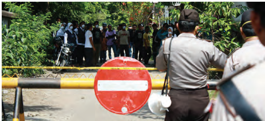
Pandemic containment exercise (simulation), conducted by the Ministry of Indonesia with the support of WHO Indonesia.

Citizens should have access to mechanisms to express their concerns and priorities with regard to surveillance. For example, communities may express concern about a potential cluster of birth defects or cancers that necessitates not only targeted epidemiological studies but also the creation of surveillance systems. Priorities should not be set solely by experts nor by those with access to health officials and policy-makers, neglecting populations with less opportunity to voice their concerns.