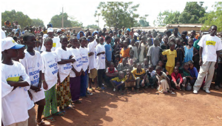
A crowd at a community event to launch a vaccination campaign.

The discipline of public health ethics has developed rapidly during the past two decades. Its central focus has been on articulating and exploring the ethical issues that arise in the pursuit of population health. This has resulted in a focus on concepts such as the common good, equity, solidarity, reciprocity, and population well-being. This is not to say that more individual values such as autonomy, privacy, and individual rights