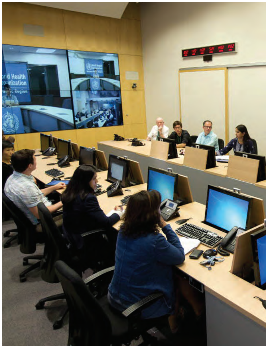
The WHO Strategic Health Operations Centre (SHOC) May 3, 2009.