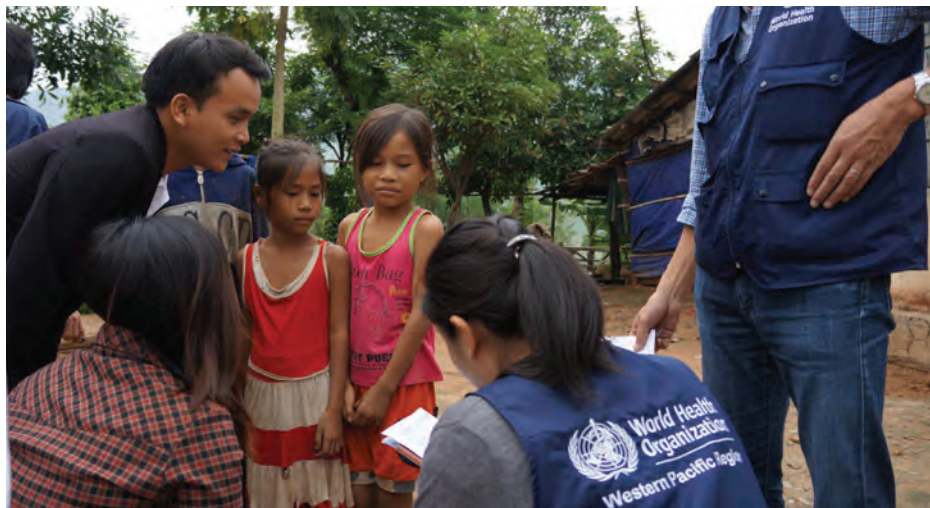
WHO Immunization officers visit Quang Binh Province, Viet Nam to monitor the Measles-Rubella Immunization campaign.

The governance mechanisms recommended in Guideline 2 should ensure that the exceptional conditions, if any, under which identifiable surveillance data may be shared are specified and made transparent. Such a review will require determination of whether the threat is of sufficient magnitude to warrant potential damage to the integrity of and trust in public health surveillance systems. Sanctions must be in place to prevent inappropriate data-sharing by public health agencies and inappropriate use of data by agencies outside the public health sector.