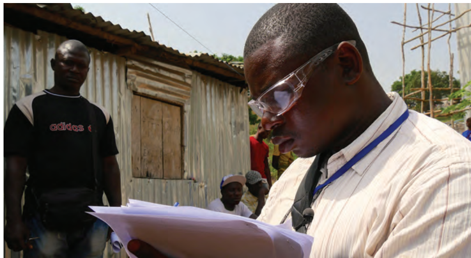
Medical student and district surveillance officer investigating suspected Ebola cases in Western Region of Sierra Leone.

As part of continuous pre-epidemic preparedness, countries should review their laws, policies and practices on data sharing to ensure that they adequately protect the confidentiality of personal information and address other relevant ethical questions, such as settling disputes about the ownership or control of surveillance data. Efforts should be made to ensure that rapid sharing of surveillance information with immediate implications for protecting public health and advancing the common good should not preclude subsequent publication in a scientific journal (87).