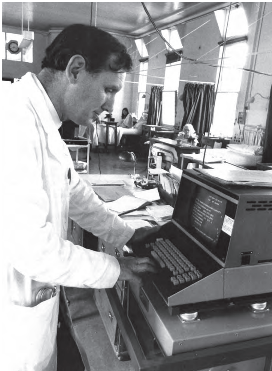
Bedside computer in the diabetic ward of the King's Hospital, London, 1970s.