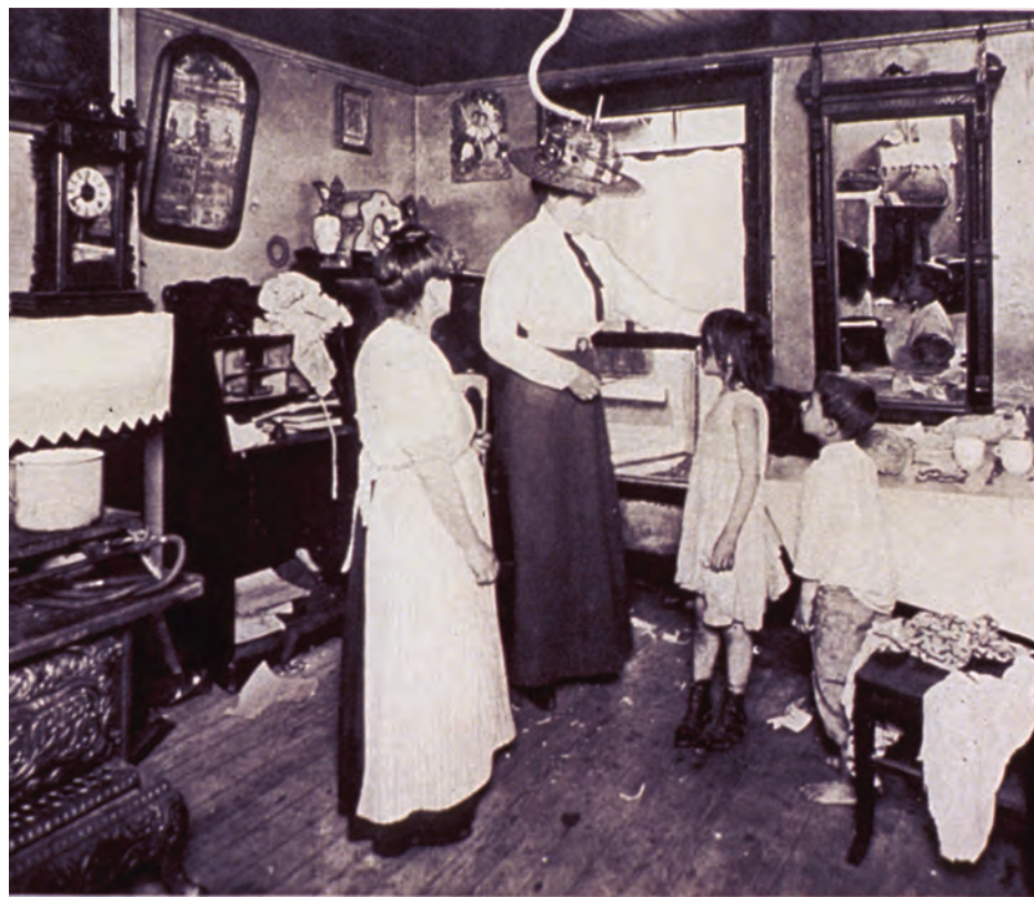
The school nurse is the most efficient link between the school and the home.

and global communities, thus potentially empowering the most vulnerable. The pursuit of equity establishes a warrant for surveillance, and the global community should provide the necessary help in moving from collecting and analysing data to action (see Guideline 6).