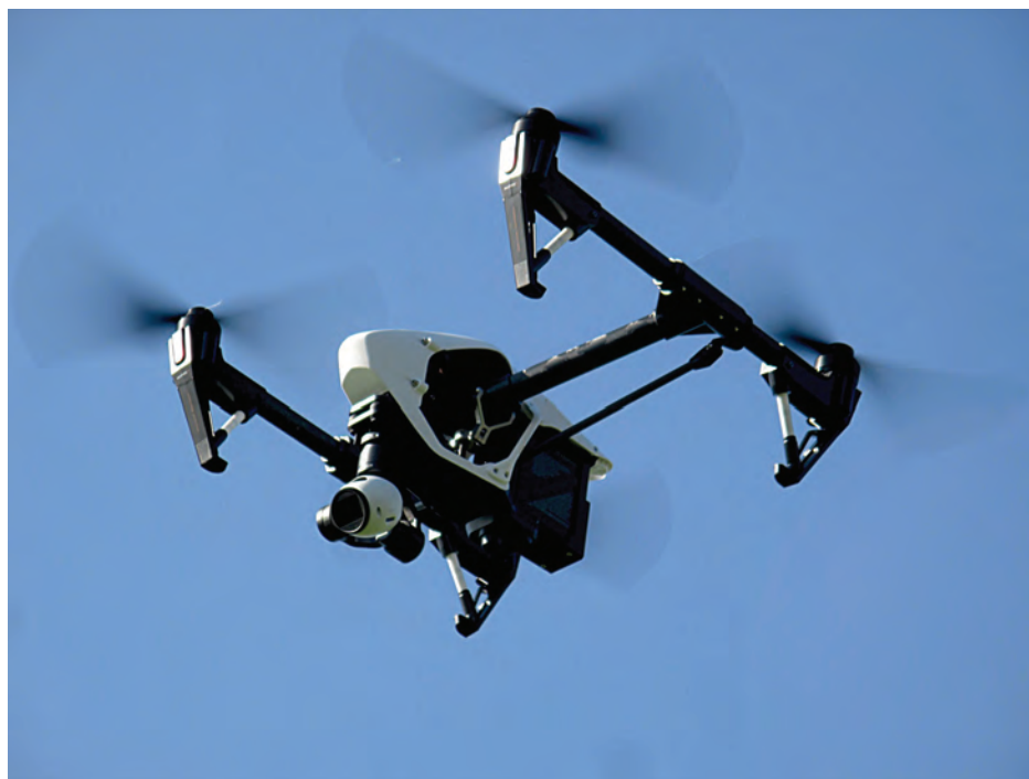
Drone in clear sky. Robert Lynch.

When the collection of names or unique identifiers is considered imperative, this requirement should be made explicit in planning the programme. Not only will countries make different judgements, but the requirement for names may not be uniform within countries. Personal data may be required only at local level, while anonymized or aggregate data may be sufficient at higher levels in a country or globally.