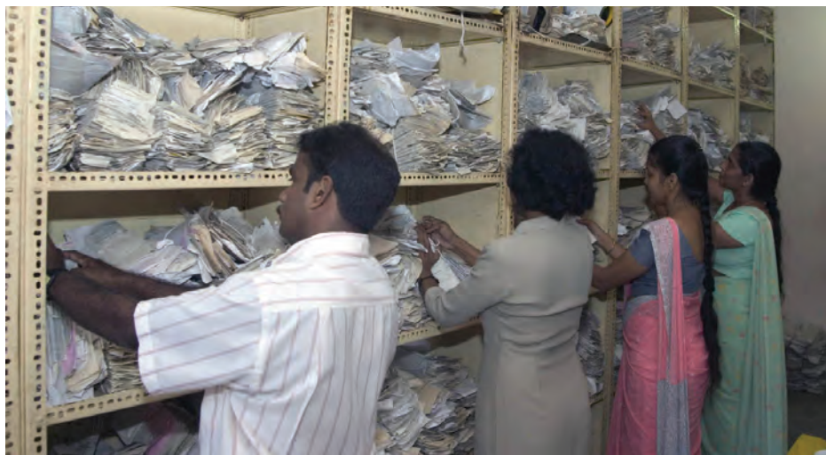
Staff at the Medical Records Office sort through patient files at Karapitayam Hospital, Galle.

The imperative to secure data should not be considered a license to refuse to use or share surveillance information effectively for legitimate public health purposes. (See guidelines 14–17 on sharing and the discussion in Guideline 2 on meaningful ethics training.)