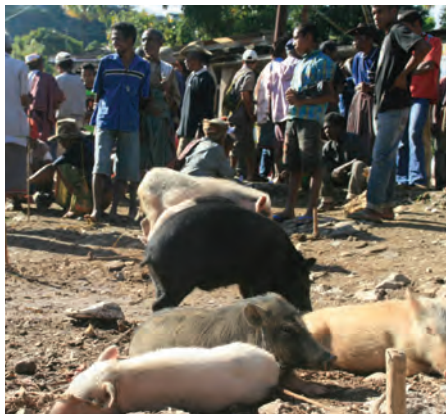
Dog and pig vendor at market day, Atsabe, Ermera.

Surveillance is conducted in a context in which there have been significant advances in the capacity to collect and share data from previously unimagined sources, such as social media or geospatial mobile phone data. There have been parallel technological leaps in possibilities for identifying disease; genetic analysis, as just one example, allows rapid identification of pathogens or pathogenic strains. At the same time, inequalities within societies and within the global community have become more marked. There are growing gulfs in the capacity of different nations and locales to take advantage of technological change. Civil conflicts in different countries inevitably trigger health crises