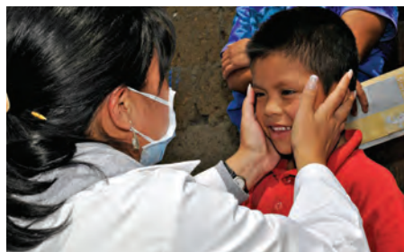
Health brigades in Chiapas, Mexico, during the epidemic of H1N1 influenza, 2009.