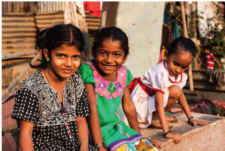
Children's Environmental Health in India.

Data collected for clinical purposes (for example to diagnose infectious disease, to monitor microbial resistance, to monitor NCDs like diabetes or to track behaviour associated with coronary heart disease or obesity) can be used for legitimate public health surveillance purposes, provided that such use meets the criteria bar set in guidelines 1, 3, 4 and 7–14 of this document. Such repurposing requires adequate protection of data security and confidentiality (Guideline 10).